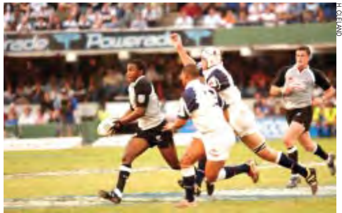
The Sharks in Super 12 action. Absa Stadium, their home ground, is ten minutes by car from Umhlanga.