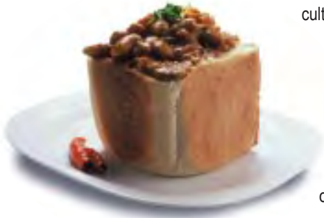
Hungry travellers can pick up a bunny chow – curry in a half-loaf of bread.

route weaves together a wealth of cultures and religions firmly intertwined in time and space. Here you can explore heritage trails and pick up souvenirs – colourful beadwork, skillfully crafted baskets or mats of woven grass and sculpted works of art.