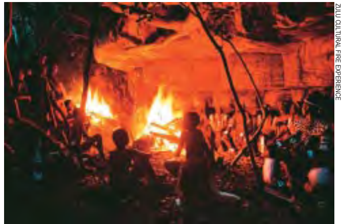
ZULU CULTURAL FIRE EXPERIENCE

Close by is the site of the new international airport to be built at La Mercy, scheduled for completion in 2009, which will place Umhlanga on the map for international entrepreneurs and other 'movers and shakers'.