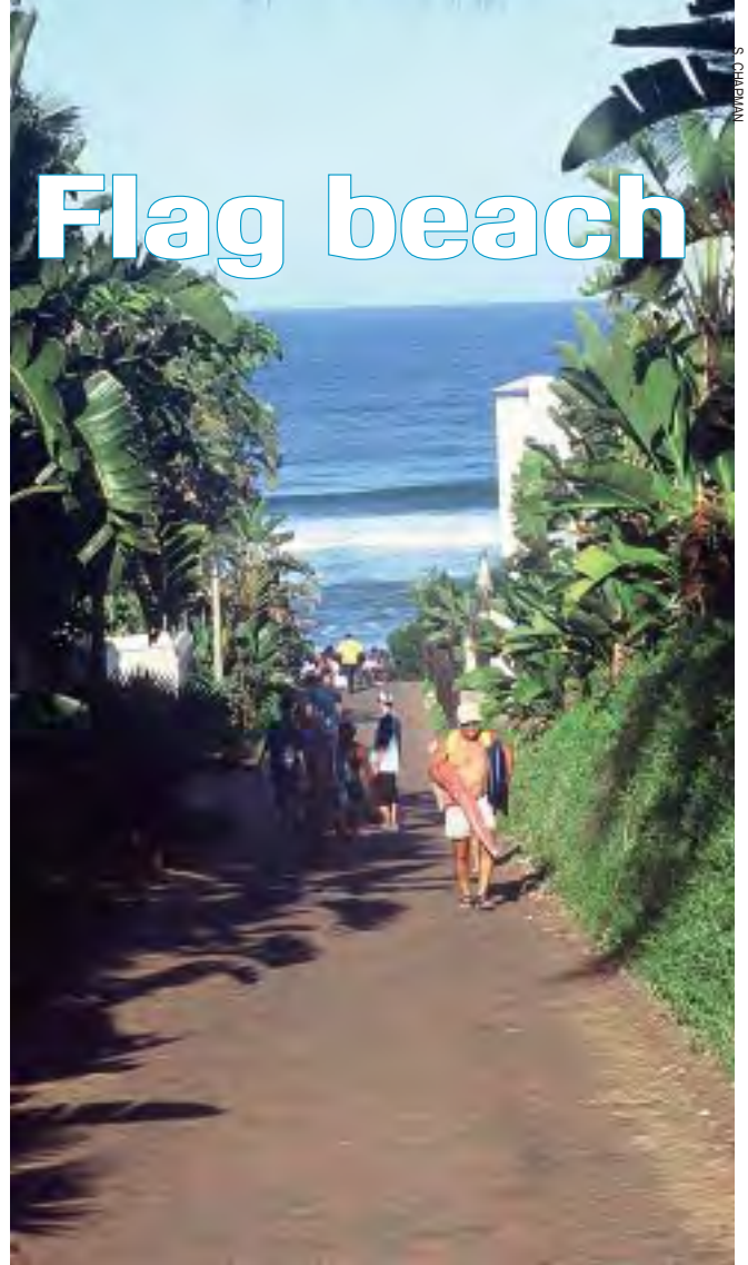
Strategic paths link town to beach.

Tranquil rock pools at Umdloti, just a few kilometres north of Umhlanga.