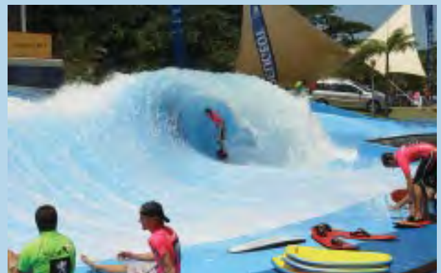
In the tube at The Wave House.

The Old Mutual-MTN ScienCentre is a world-class science that brings science and technology alive for both children and adults. The