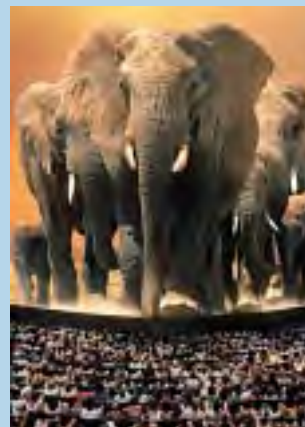
The thrilling IMAX Theatre.

ScienCentre entertains while it educates with over 200 magical interactive science and technology displays. These include giant whisper dishes, an amazing gyroscope, an air rocket, centripetal swing and a set of puzzling exhibits that will test your logic to the max. The ScienCentre also runs special weekend and holiday activity programmes for children and hosts a number of local and international science and technology related exhibitions and expos. Contact (031-566 8040).