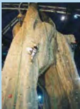
The Rock at Gateway provides a challenge for rock climbers.

IMAX is the ultimate movie experience. With crystal clear images five stories high and wrap-around digital surround sound, IMAX takes you to places you only imagined.