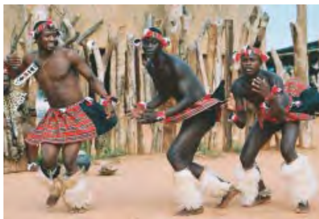
ZULU CULTURAL FIRE EXPERIENCE