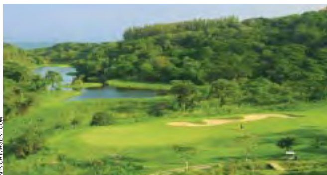
The Zimbali Country Club, with indigenous forests and sea views.