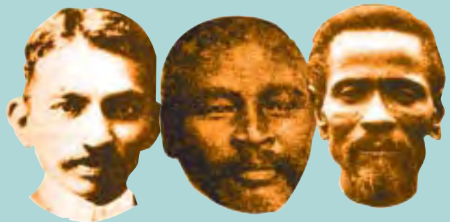
Some of KZN's icons of history: Mahatma Gandhi, John L Dube and Isaiah Shembe.