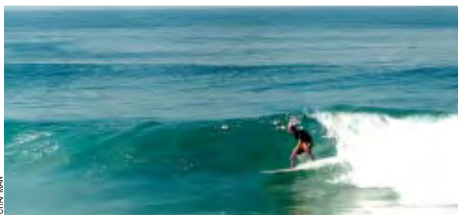
A surfer snags a clean right-hander at Umdloti.

With its great weather (more than 320 sunny days a year) the people of the Zulu Kingdom are sport crazy!