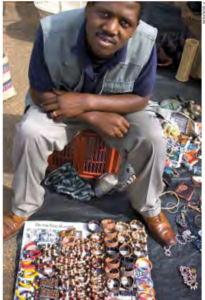
A roadside craft seller displays his wares.

Next on the roadway is the farming village of Umhlali, established by British and Scottish Byrne settlers in 1850. It lies inland from Salt Rock and Sheffield Beach. It has a quaint and unique Sugar Village theme and the buildings are designed and decorated in an 'old world' flavour. The shops are varied and visitors can enjoy fast food, homemade goodies and fresh farm produce.